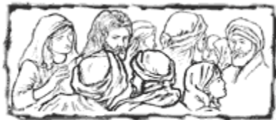
Jesus heals a sick woman

Soon afterwards Jesus went to a town called Nain, and his disciples and a large crowd went with him. 12 As he approached the gate of the town, a man who had died was being carried out. He was his mother's only son, and she was a widow; and with her was a large crowd from the town. 13 When the Lord saw her, he had compassion for her and said to her, "Do not weep." 14 Then he came forward and touched the bier, and the bearers stood still. And he said, "Young man, I say to you, rise!" 15 The dead man sat up and began to speak, and Jesus gave him to his mother. 16 Fear seized all of them; and they glorified God, saying, "A great prophet has risen among us!" and "God has looked favorably on his people!" 17 This word about him spread throughout Judea and all the surrounding country.